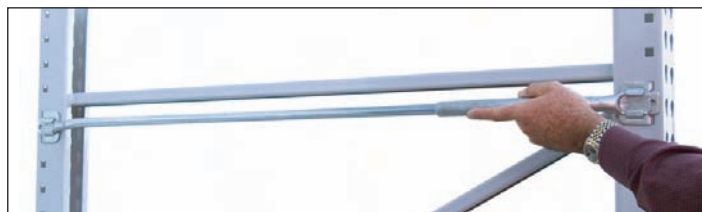
Spring-loaded Fluekeeper is easy for maintenance personnel to install from the aisle side of the rack - requires no special tools or skills

NEW FlueKeeper from DACS -Patent Pending-