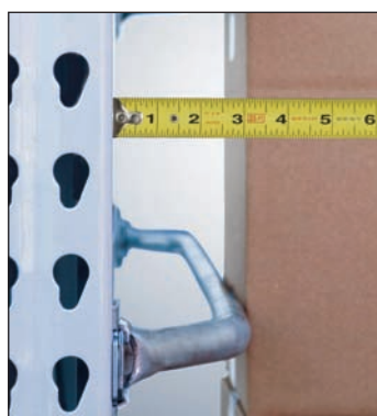
Provides 3" clearance between rack and stored material